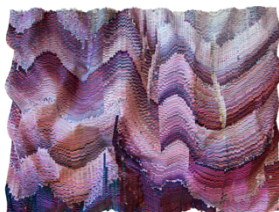
© Kenny Nguyen, Infinite Dream No. 3, 2024. Hand-cut silk fabric, acrylic paint, canvas, mounted on wall, 83 x 114 inches.