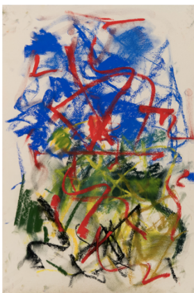
Joan Mitchell, Plastic, 1961. Painted on paper 22 3/4 x 15 1/2 in.