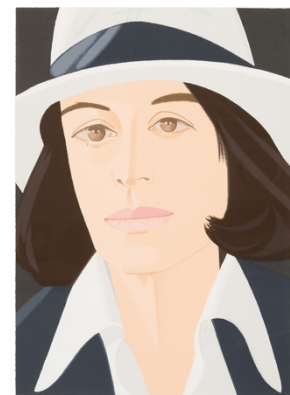
© Alex Katz, White Hat from Asia and Asia, the 1960's to the 1980's, 1960. Signed on verso 1960 on the gallery label. Colour Screenprint on Paper, 36 x 25 1/2 in., Edition 105 of 150.