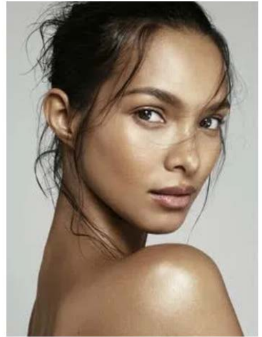
Victoria's Secret Angel Lais Ribeiro