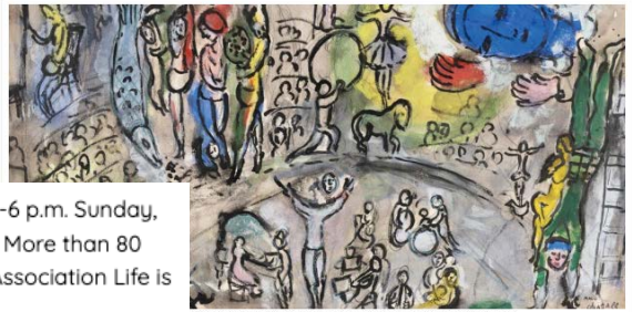
Grand Cirque, by Marc Chagall

Art Palm Beach features some of the most well-known artists in history. This year, those works will not only be on display, but also for sale.