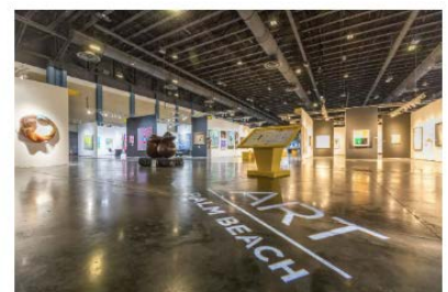
Art Palm Beach Show

Palm Beach, FL – We are just days away from the much-anticipated opening of Art Palm Beach 2024. In its second year of being owned, directed, and produced by the same visionaries as the LA Art Show, this year promises to be one of the biggest infusions of contemporary and modern art, AI-themed exhibitions, and philanthropy ever seen in the Palm Beaches. With more than 80 distinguished galleries featuring some of the best artists from around