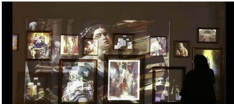
The programming for DIVERSEartPB at this year's Art Palm Beach will examine the role of artificial intelligence in art.