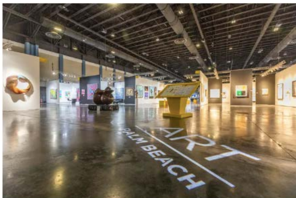
Art Palm Beach returns Jan. 24-28 to the Palm Beach County Convention Center in West Palm Beach.

More: Flagler Museum's Tuesday night chamber music concerts return Feb. 6