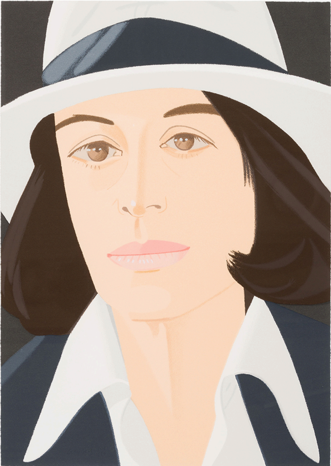
© Alex Katz. White Hat (from Alex and Ada, the 1960's to the 1980's ), 1990; Signed on verso titled on the gallery label; Colour Screenprint on Paper; 36 x 25 1/2 in.; Edition 105 of 150