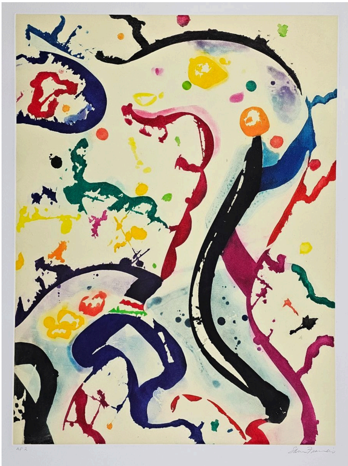
Sam Francis, 1923-1994. SFE-073, 1990; Aquatint in colours with chine collé on wove paper; Signed in pencil; 34 3/4 x 27 3/4 inches