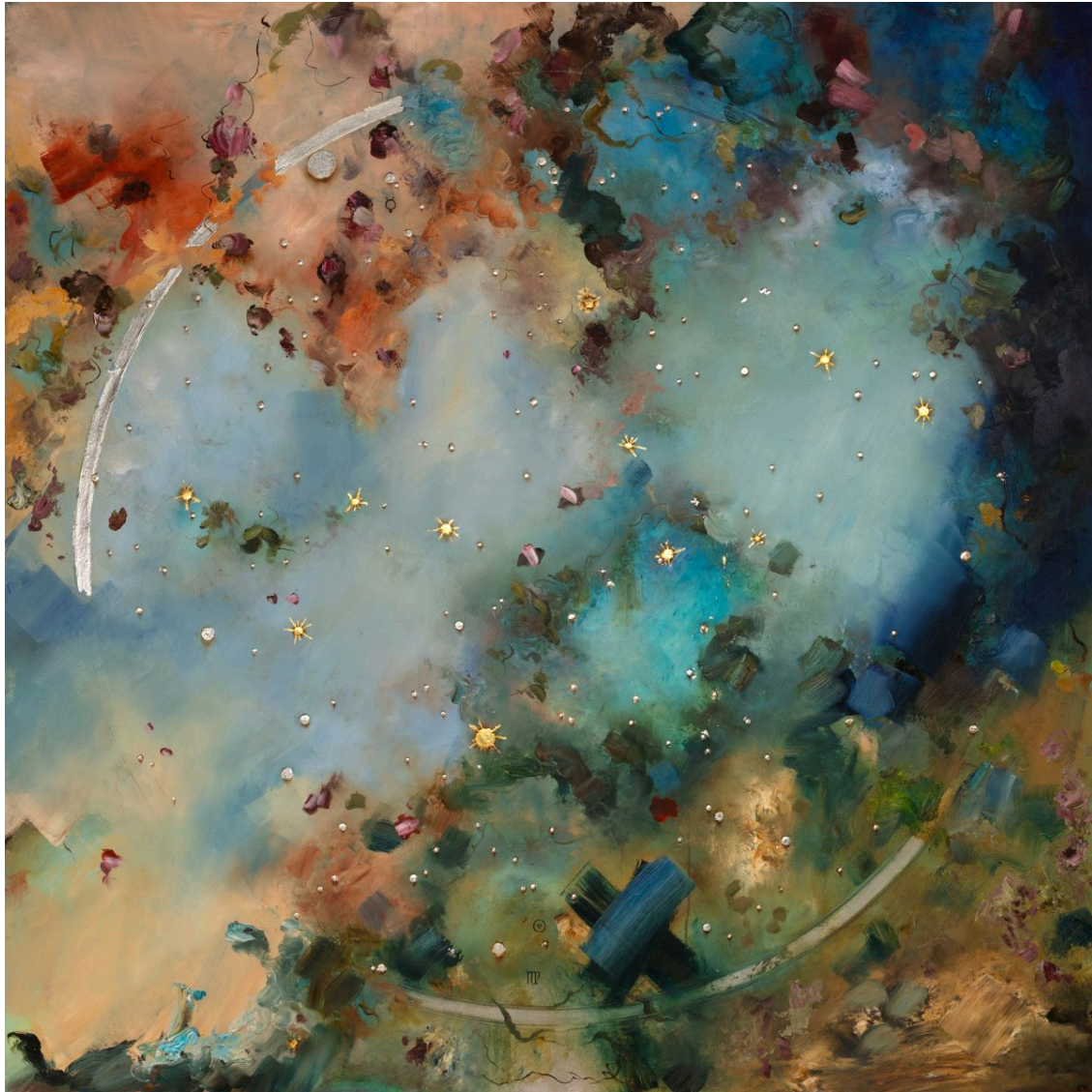
© Chris Rivers. Virgo , 2024; Oil, genuine gold, silver and platinum leaf on panel; 47.2 x 47.2 inches

Visit pontonegallery.com to learn more about their dynamic program and international roster of artists.