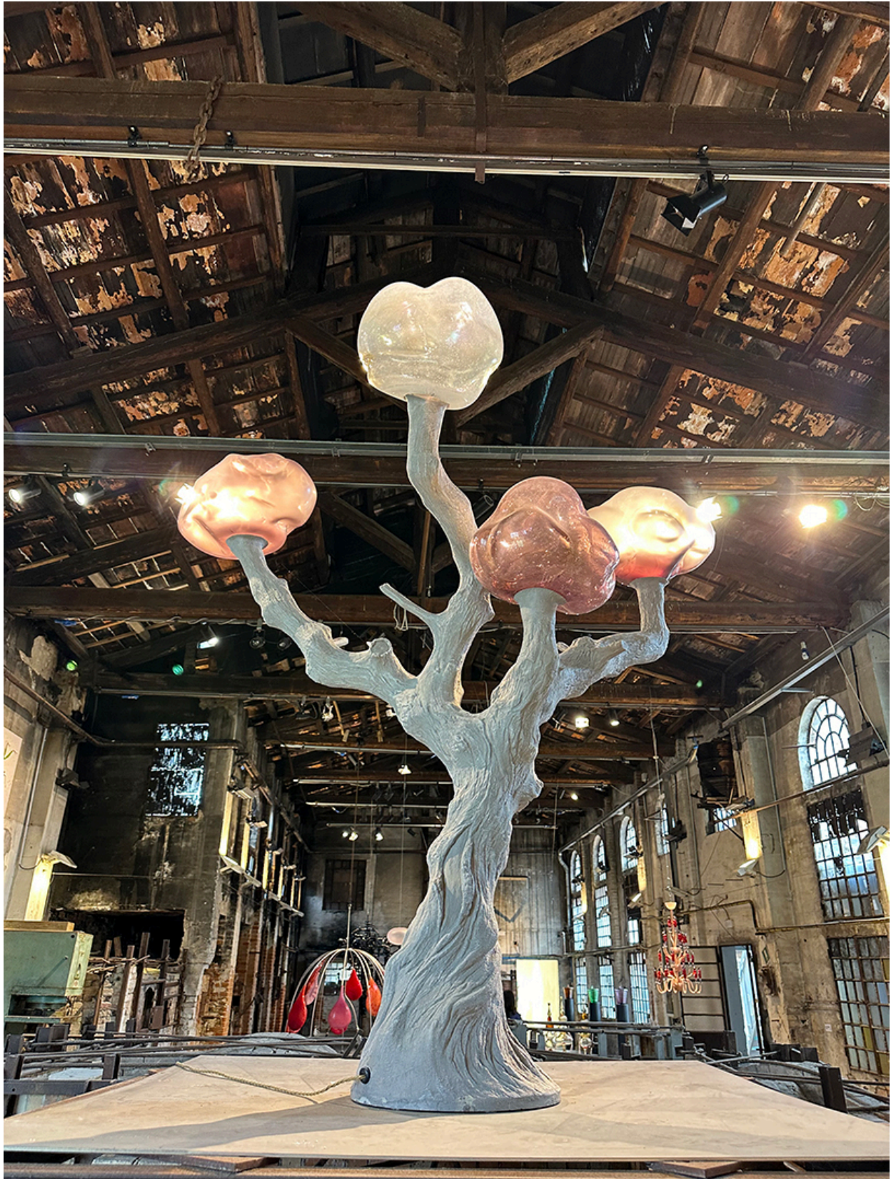
Irene Cattaneo, "Forget Me No-w/t", 2024, aluminium, hand blown murano glass. Part of the "Glasstress Boca Raton 2025" exhibition on view from April 23 through October 26, 2025.

To learn more about the Boca Raton Museum of Art, its exhibitions, and programs, visit bocamuseum.org .