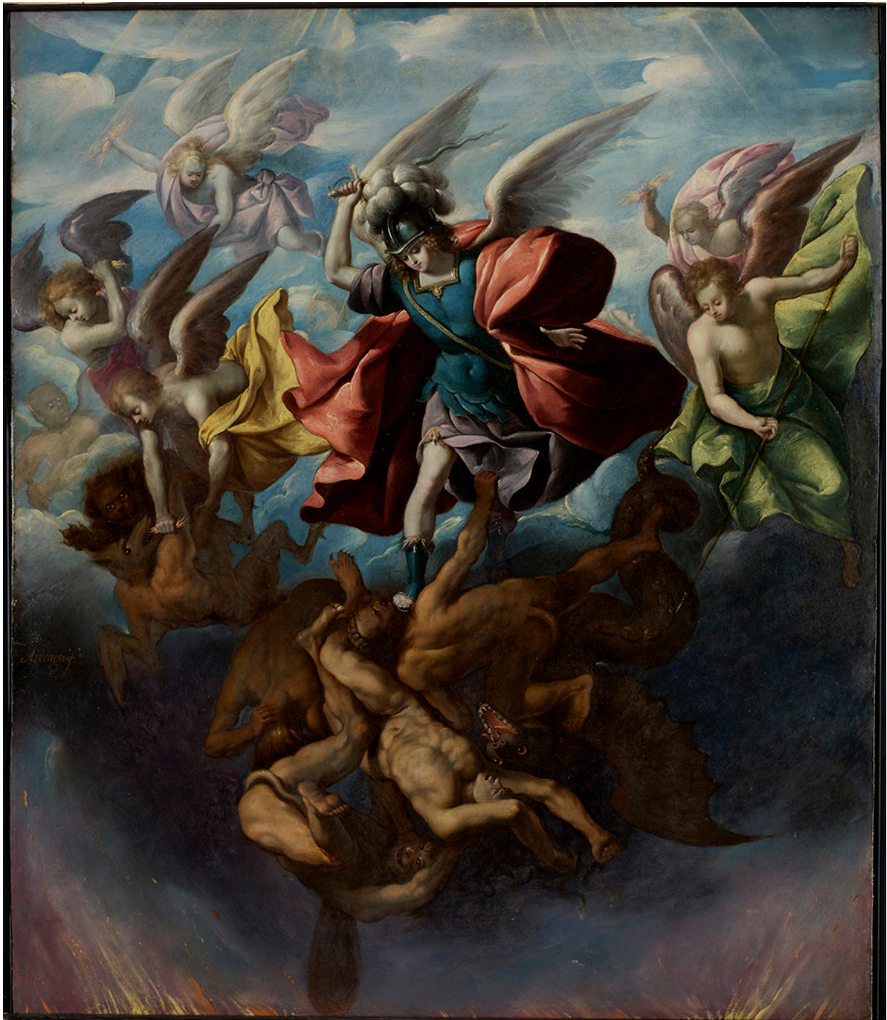
Sebastián López de Arteaga, Saint Michael Striking Down the Rebellious Angels, 1650-1652, oil on copper. Part of the "Splendor and Passion: Baroque Spain and Its Empire" exhibition on view from November 7, 2024 through March 30, 2025.

As part of this partnership, Art Palm Beach will feature a special preview of the Museum's upcoming exhibition, Glasstress Boca Raton 2025 . This preview will showcase contemporary glass installations by renowned artists such as Ai Weiwei, Sean Scully, and Maria Magdalena Campos-Pons, offering a glimpse into the innovative fusion of modern art and traditional Murano glassmaking techniques.